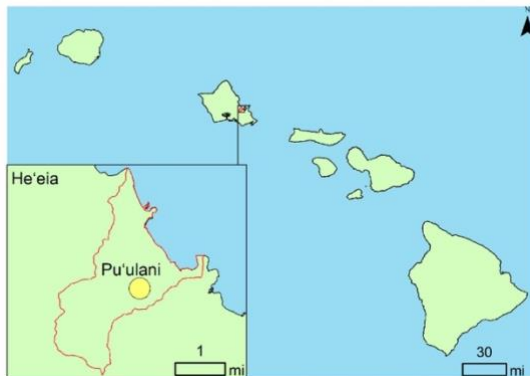
Fig 1: Pu‘ulani (yellow dot); He‘eia (red outline); Pae‘āina (whole map).

Agroforestry includes any land-use system that integrates trees and crops (or other tended and harvested plant or animal species). Agroforestry systems can range from a few trees in a field or pasture to stewarded multi-story forests.